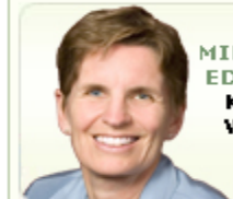
MINISTER OF EDUCATION Kathleen Wynne »